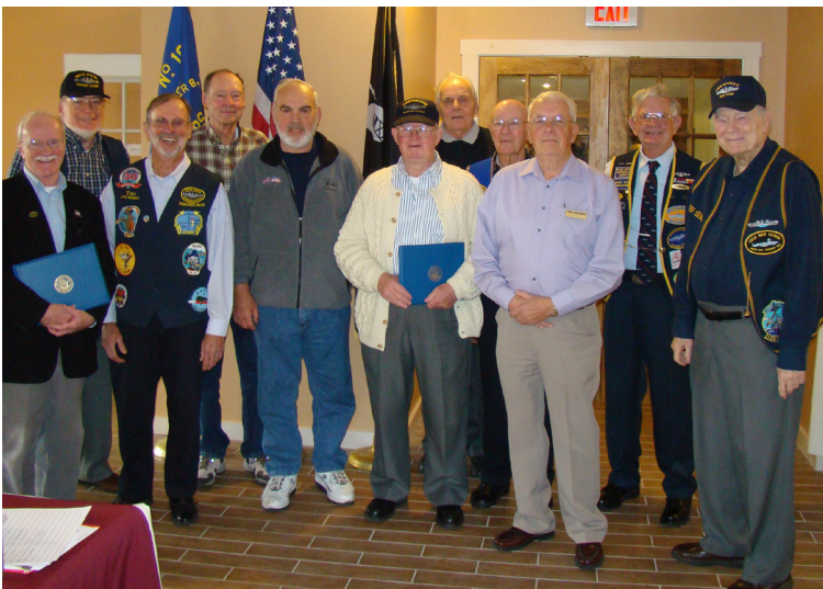
Holland Club members who attended the luncheon at Flag Hill Winery on November 20, 2010.