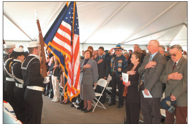
Johnson Hall Dedication April 17, 2004