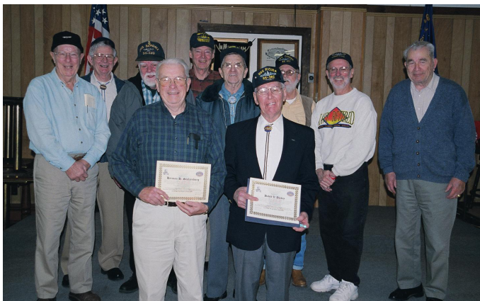
Above: The new inductees join their fellow Holland Club members who attended the ceremony.