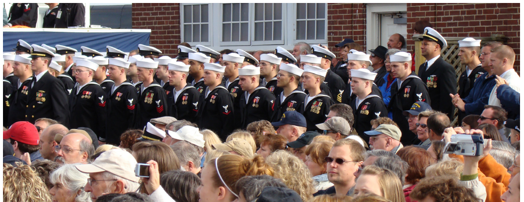
USS New Hampshire (SSN 778) crew