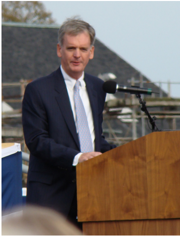
New Hampshire Senator Judd Gregg

The USS New Hampshire was officially inducted into the Naval fleet on Saturday, October 25 before a large group of VIPs, crew families, subvets, shipyard employees and the general public that gathered at the Portsmouth Naval Shipyard.