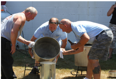
Sons of the American Leagion